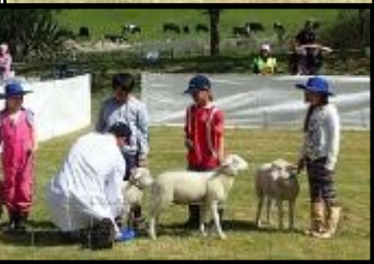
Waikite Valley School section in the Parade—sporting our fantastic new show jackets